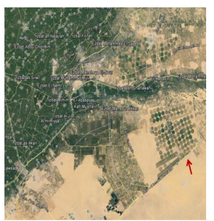
Fig. 1: Site location as illustrated on the administrative map and on satellite image.